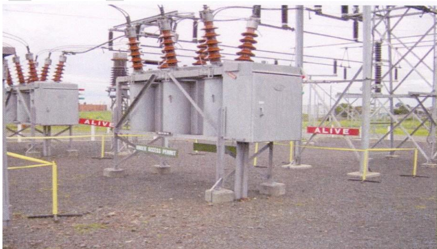
EXAMPLE C 'Barrier out' method for the erection of a barrier in a substation