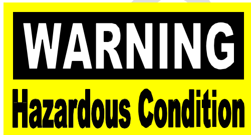
Front of tag

HAZARDOUS CONDITION WARNING TAG – This tag is used to warn of a particular hazard or hazardous condition that is not likely to be life threatening.