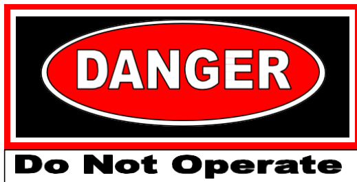
Front of tag

DO NOT OPERATE TAG – This tag is used to warn that the operation of the device or equipment to which the tag is attached is likely to be life threatening.