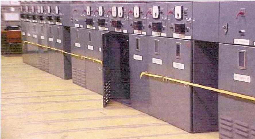
EXAMPLE B 'Barrier out' method for the erection of a barrier on totally enclosed switchgear