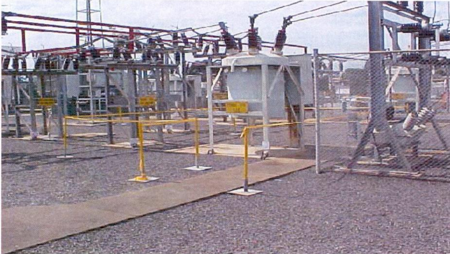
EXAMPLE A 'Barrier in' method for the erection of a barrier in a substation