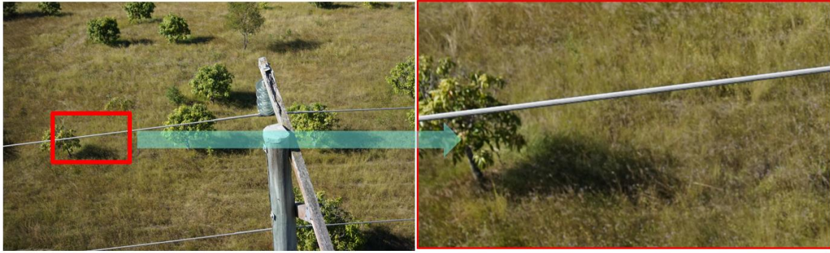
Figure 3 Sample Drone captured image of an overhead conductor