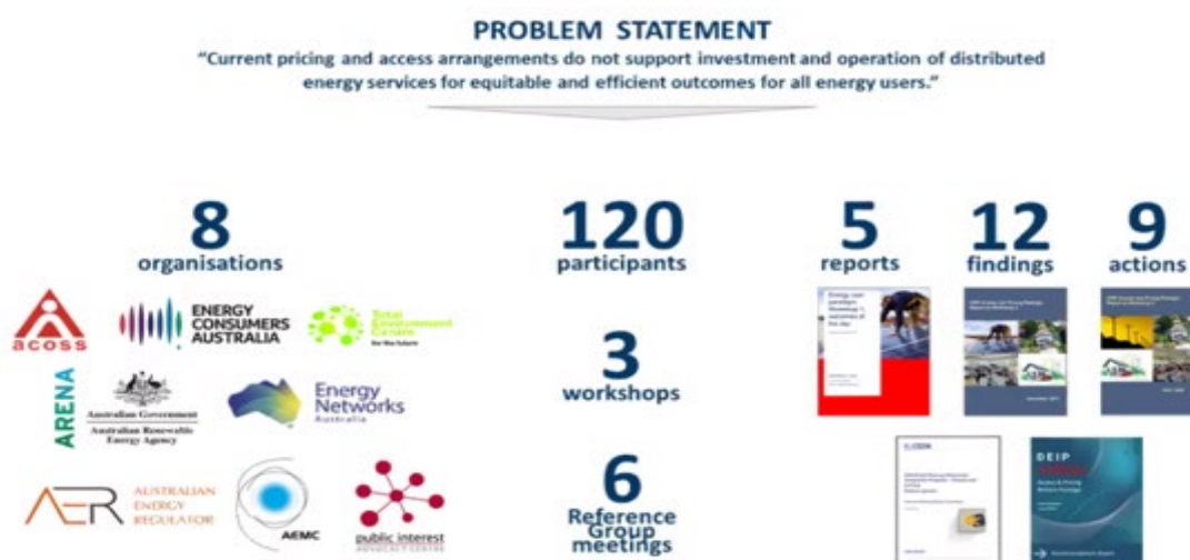
Figure 1: ARENA DER Access and Pricing Work Package

Energy Networks Australia welcomed 4 the three rule change requests that were developed and submitted to the Commission in July 2020 as a result of this extensive work package.